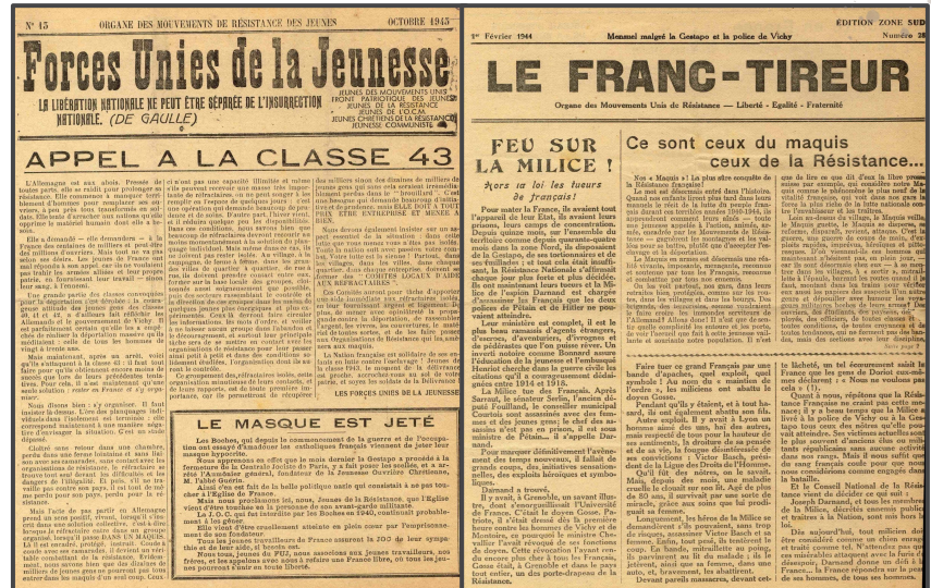
Figure 4: One of the newspapers Forces Unies de la Jeunesse (n°13, October 1943) and Le Franc-Tireur (n°28, 1 February 1944)

High school students were not content with distributing their newspapers within the school; they also took bundles of newspapers with them when they returned to their families each week and distributed them among their friends and relatives . Weapons and plastic used in the manufacture of explosives were also brought into the school.