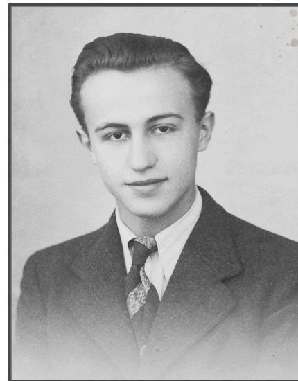
Figure 2: Photographic portrait of François-Yves Guillin (1921–2020)

However, not all students were resistance fighters . Some students supported the Vichy regime and were openly anti-Semitic . One day, three of them attacked Cerf , a Jewish student. He was violently struck in the face, but several students, including François-Yves Guillin , defended him.